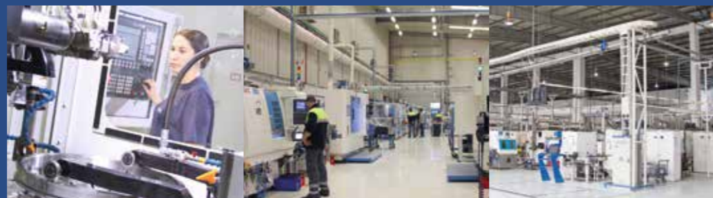
NKE Steyr, Austria